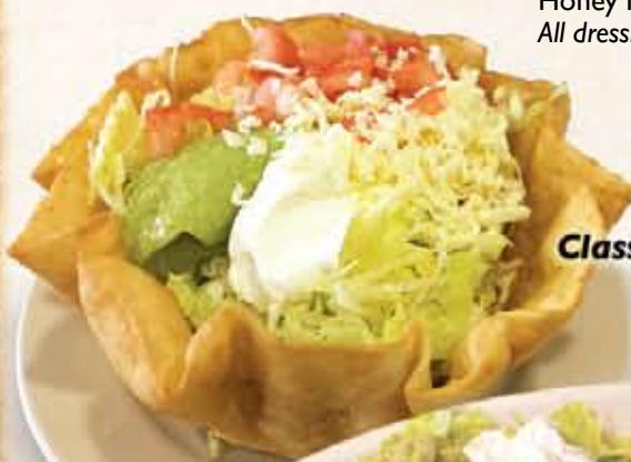
Classic Taco Salad