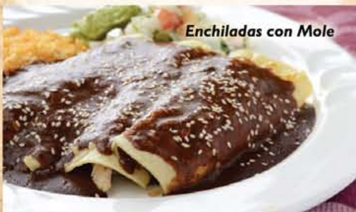
Enchiladas con Mole