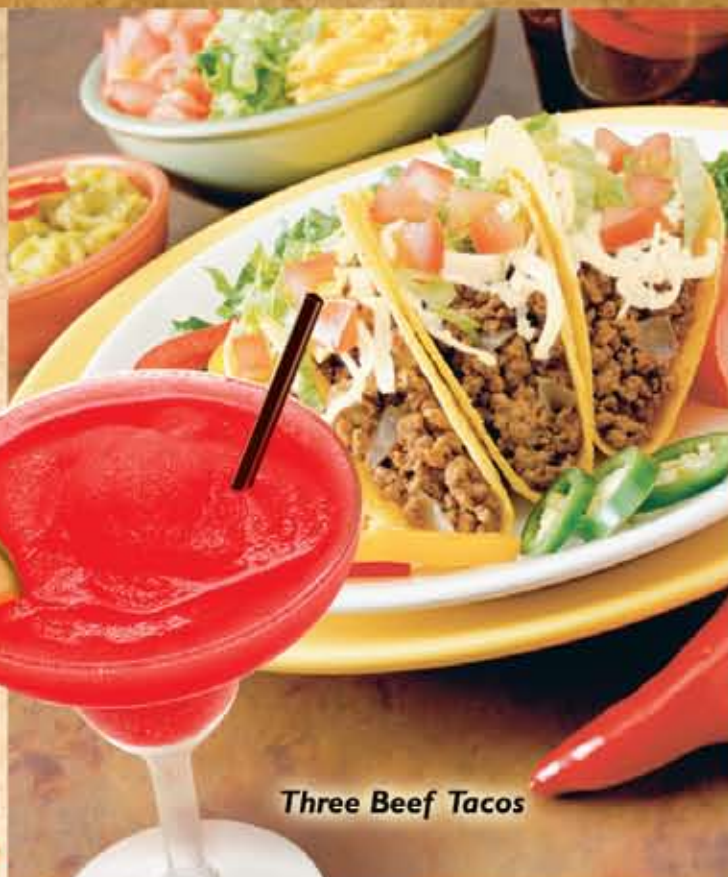
Three Beef Tacos