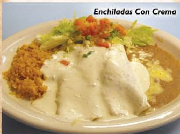
Enchiladas Con Crema